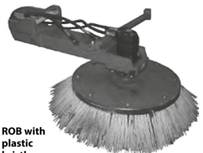
ROB with plastic bristles