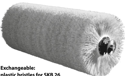
Exchangeable: plastic bristles for SKB 26