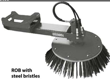
ROB with steel bristles