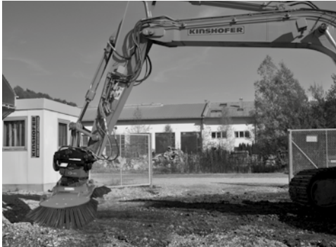
BST with adapters for excavator and pallet fork. Here: mounted to forks.